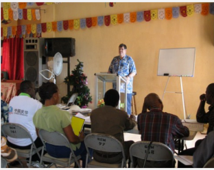
The First Class