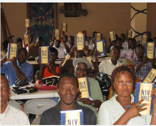
Students receive their concordance