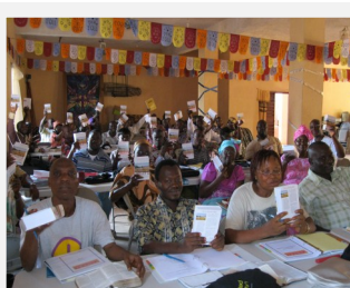
Students receive Halley's Bible Handbook