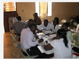
Students work on group project